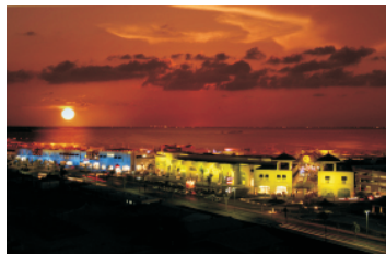
Shopping and Nightlife, Cancun