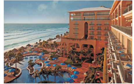
The Ritz Carlton, Cancun

The hospital has a full service cafeteria and coffee shop. There is a multi-story shopping mall with a movie theater and restaurants located three blocks away from hospital. A short cab ride from the hospital to the shopping center should cost $3-5 (US).