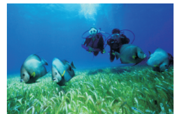
Scuba diving, Cancun