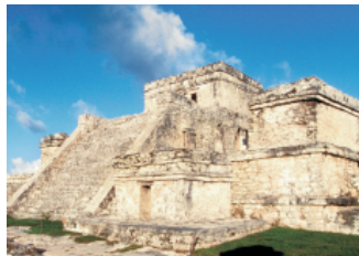
Chichen Itza (approx. 2 hours outside of Cancun)