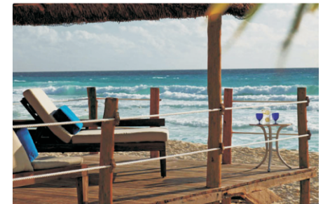
Waterfront at Ritz Carlton, Cancun