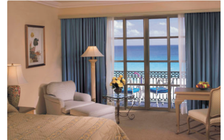
Guest Room at Ritz Carlton, Cancun