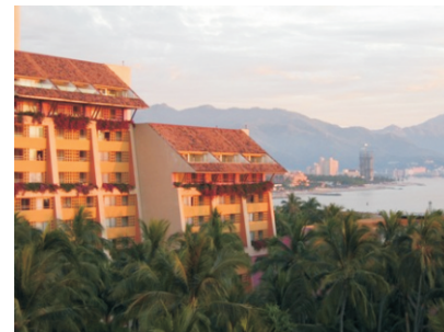
The Westin - Puerto Vallarta

Escape to 21 tranquil acres dotted with swaying palm trees and fronted by 879 feet of private Pacific Ocean beach. The Westin Resort & Spa, Puerto Vallarta offers all this splendor just minutes from the international airport and charming downtown.