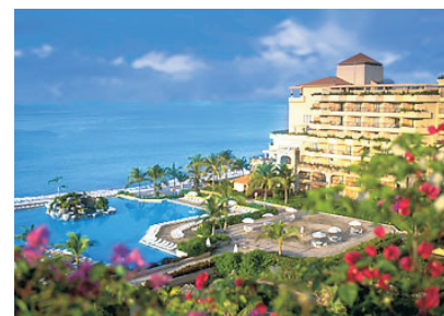
Casa Magna Marriott, Puerto Vallarta

Nestled between the Sierra Madre Mountains and Banderas Bay, CasaMagna Marriott Puerto Vallarta Resort & SPA is a gateway to all the adventures and pleasures of Mexico. At the Marriott Puerto Vallarta, both couples and families can enjoy beautiful amenities.