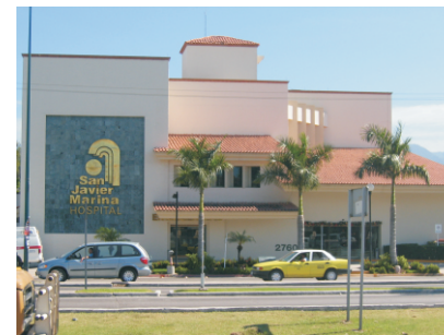
San Javier Hospital Marina

The HIFU procedure takes place in San Javier Hospital Marina, a Certified Specialty Hospital in Puerto Vallarta, Mexico. This is a private center with experienced staff devoted to providing HIFU while you are there.