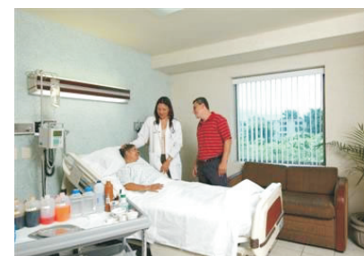
Typical Recovery Room at San Javier Hospital Marina

On the day of the procedure the patient is picked up from the hotel and transported to the hospital. After the procedure and recovery, the patient is transported back to the hotel to recover more comfortably. In some instances it may be necessary for the patient to take a cab to the hospital. In this case, simply ask the hotel to call you a taxi, the ride to the hotel should take approximately five minutes and cost a couple dollars ($3-5). Upon arrival at the center, you will enter a small waiting area where you should wait until you are assisted by a HIFU nurse. During the procedure, spouses/partners or friends who accompany the patient will wait in the waiting area until the procedure is over and the patient is in recovery.